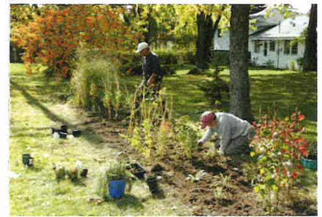
* Monarch Waystations is a certification program developed by Monarch Watch in 2005. Its aim is to develop places that provide resources necessary for monarchs to produce successive generations and sustain their migration.

Butterflies and moths depend predominantly on native plants as their larval host plants. In the case of monarchs, milkweed species are critical for their survival. Whenever possible, grow local genotype native plants that have co-evolved in their native habitats with other plants and wildlife, such as insect pollinators. Local genotype native plants are vigorous and hardy. Adapted to their region, they can survive winter cold and summer heat. The deep roots of native plants, especially those of prairie plants, trees and shrubs, hold soil, control erosion and withstand droughts. Native plants, once established, require little watering and better tolerate native pests. To prevent the local extinction of native flora, plants should be purchased from reputable nurseries and not dug from natural areas. For local genotype guidelines: wildones.org/learn/native-plants-and-landscaping/local-ecotype-guidelines